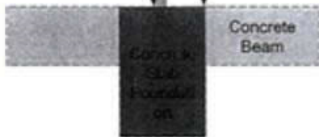
FENCE (SIDE VIEW)

Fence must be embedded into Concrete Slab